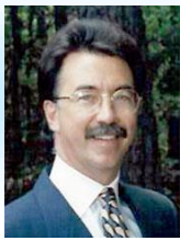
Salans Law Firm

Based on these surveys, the firm was able to obtain strategic and valuable, insightful information and feedback in order to help improve customer satisfaction, repeat business, and loyalty. Most of the feedback was very positive, with generally good marks for enthusiasm, responsiveness to client needs, and the overall desire to really help clients with their objectives. Some feedback was not totally positive. Most importantly, these surveys articulated very important and specific recommendations for improvement; for example, the need to continually clarify, agree, and communicate project objectives, scope, and status throughout the entire engagement, including the final presentation. Acting upon Topsail's findings and recommendations, the senior management team assigned a cross-section of employees into teams to solve these issues and make changes in the entire client engagement process.